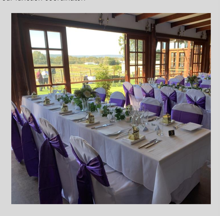
Table shapes and sizes depend on number of guests and reception seating area. Further clarification discussed with our function coordinator.